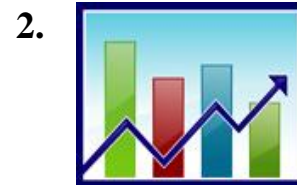
Aligning regulations for shared resources