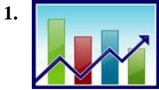
Diversify jobs portfolio mix

Outcome statement: Community members steward both a vibrant economy and our human and natural resources so that all generations thrive.