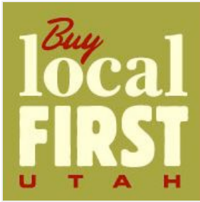
Local First Utah logo statewide