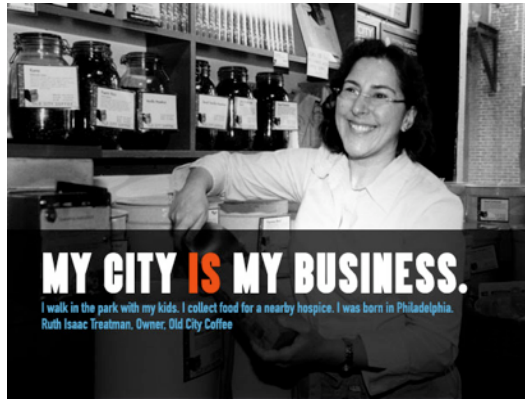
Sustainable Business Network of Philadelphia

see if they have contact information for local business owners, including either an email or postal address.)