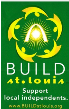
BUILD St. Louis storefront decal St. Louis, MO