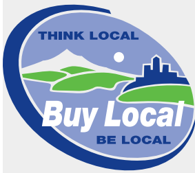
Think Local Portland window decal Portland, Oregon