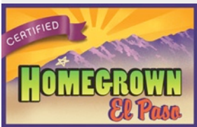
Homegrown El Paso logo El Paso, Texas