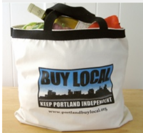
Portland Buy Local tote bag Portland, Maine