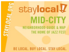
StayLocal! neighborhood business directory New Orleans, LA