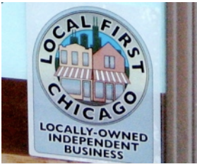
Local First Chicago storefront decal Chicago, Illinois